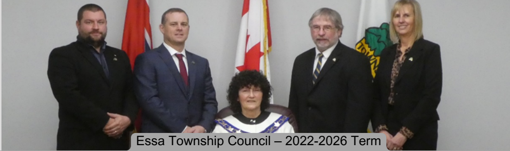
Essa Township Council – 2022-2026 Term